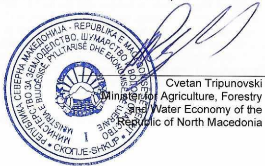
Cvetan Tripunovski Minister for Agriculture, Forestry and Water Economy of the Republic of North Macedonia